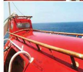
NANO-CLEAR 3D POLYMER