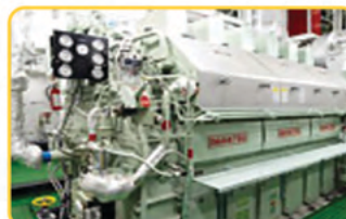
▶ HIGH QUALITY SMART SUPPLY OF SHIP PARTS TLG, PRESSURE SENSORS, UTI, PILOT LADDERS, DAIHATSU ENGINE, TURBOCHARGERS, WINCHES, VALVES.