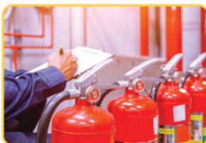
▶ LSA / FFE & LIFEBOAT SERVICES