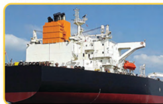
▶ SCRUBBER, BWTS INSTALLATION & SUPPLIES