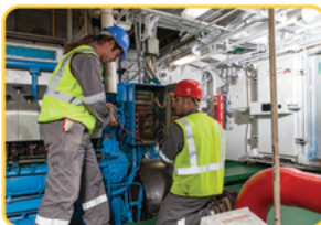
▶ MARINE & AUTOMATION SERVICES