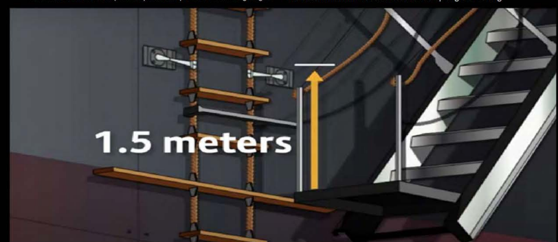
The Pilot Ladder securing magnet system must be secured 1.5mtrs up from accommodation ladder.