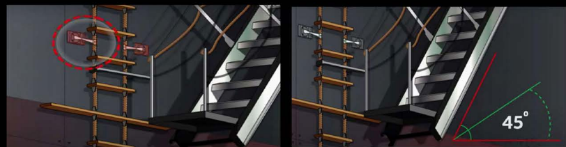
Pilot Ladders must be independently secured by SMART SCS Holding Magnet